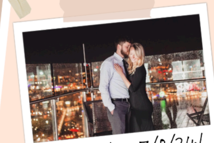
engaged on 7/8/24!